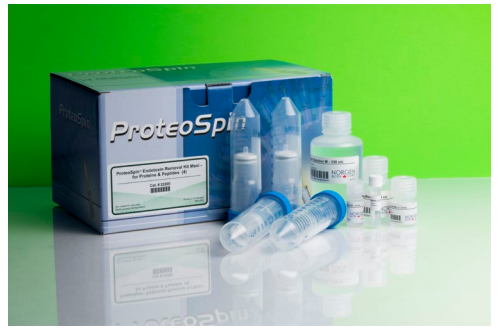
For rapid and efficient endotoxin removal from proteins and peptides